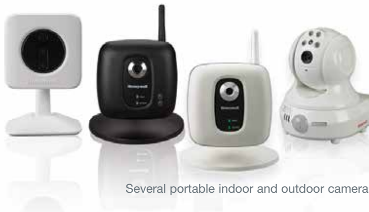
Several portable indoor and outdoor camera